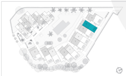
terrace collection - level 1